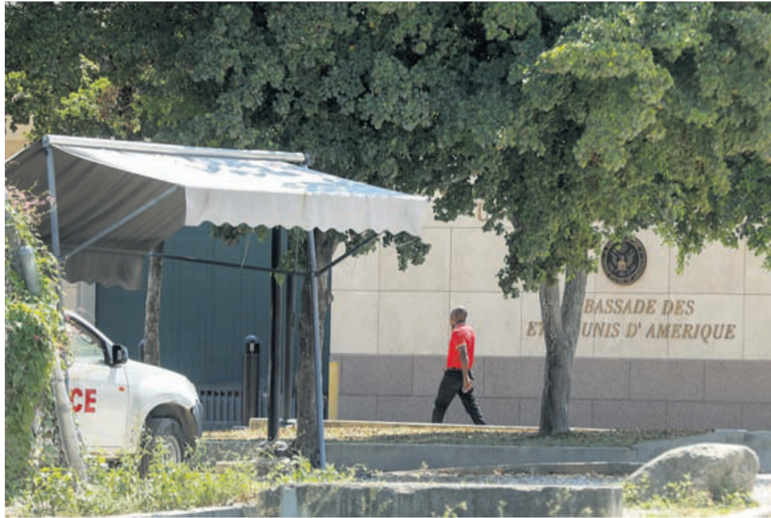
A man enters the U.S. embassy in Port-au-Prince, Haiti, Sunday, March 10, 2024.

In many cases, nonessential personnel can include the families of diplomats, but the embassy had already ordered departure for nonessential staff and all family members in July. The personnel ferried out of the embassy may have simply been rotating out, to be re-